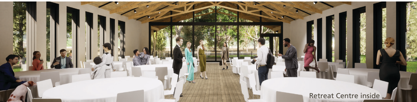
Retreat Centre inside