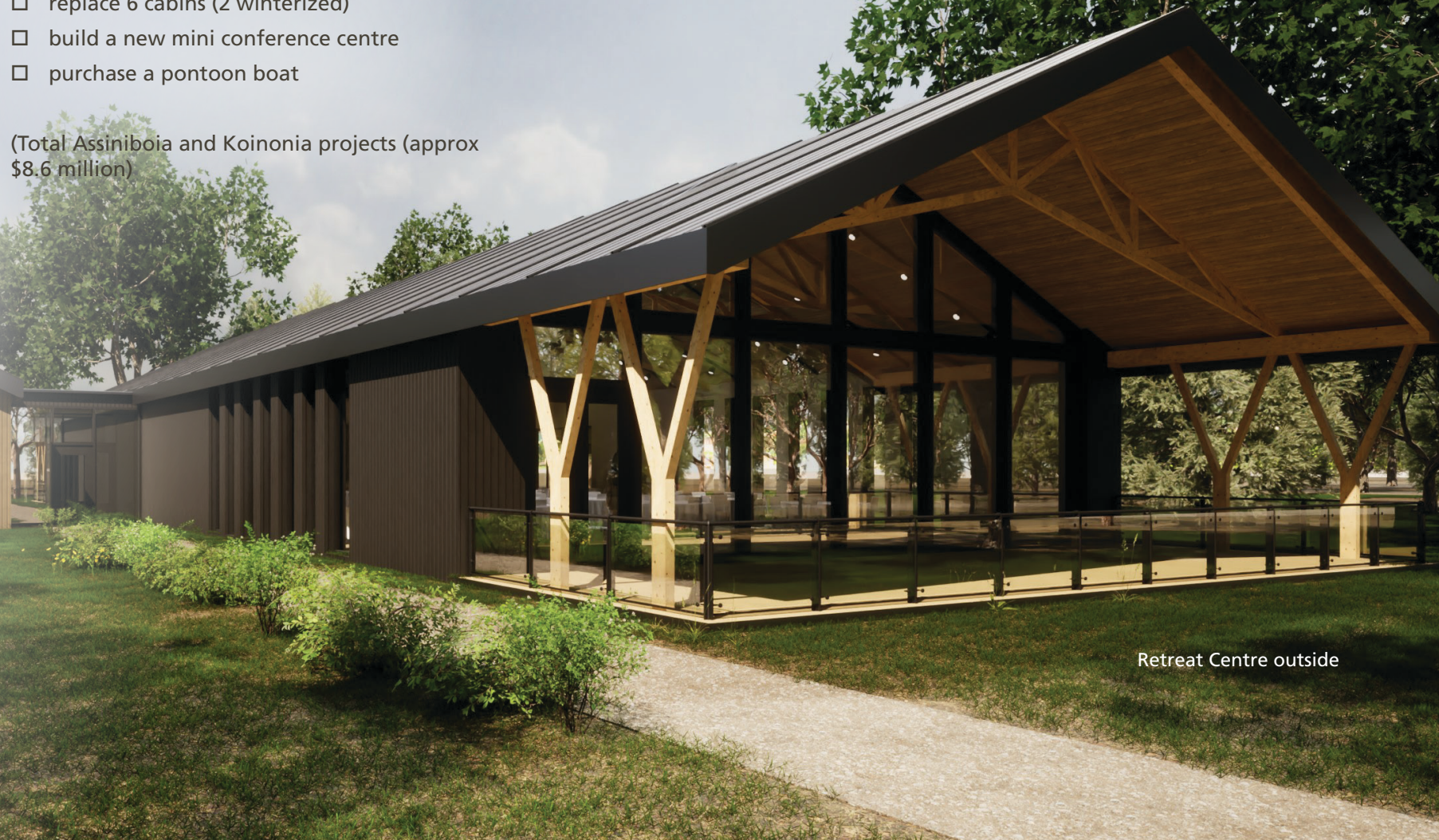
Retreat Centre outside